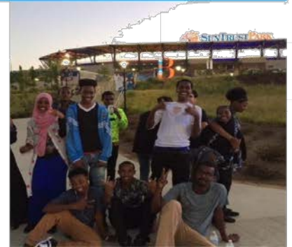
DeKalb High School (DHS)