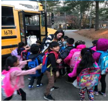
DeKalb Elementary School (DES)