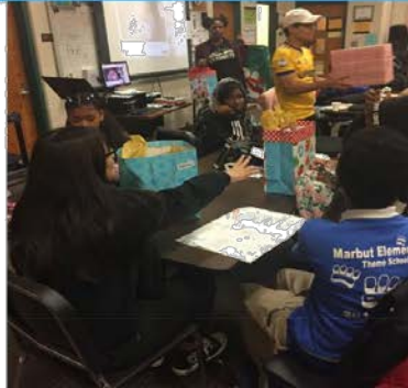
DeKalb Middle School (DMS)